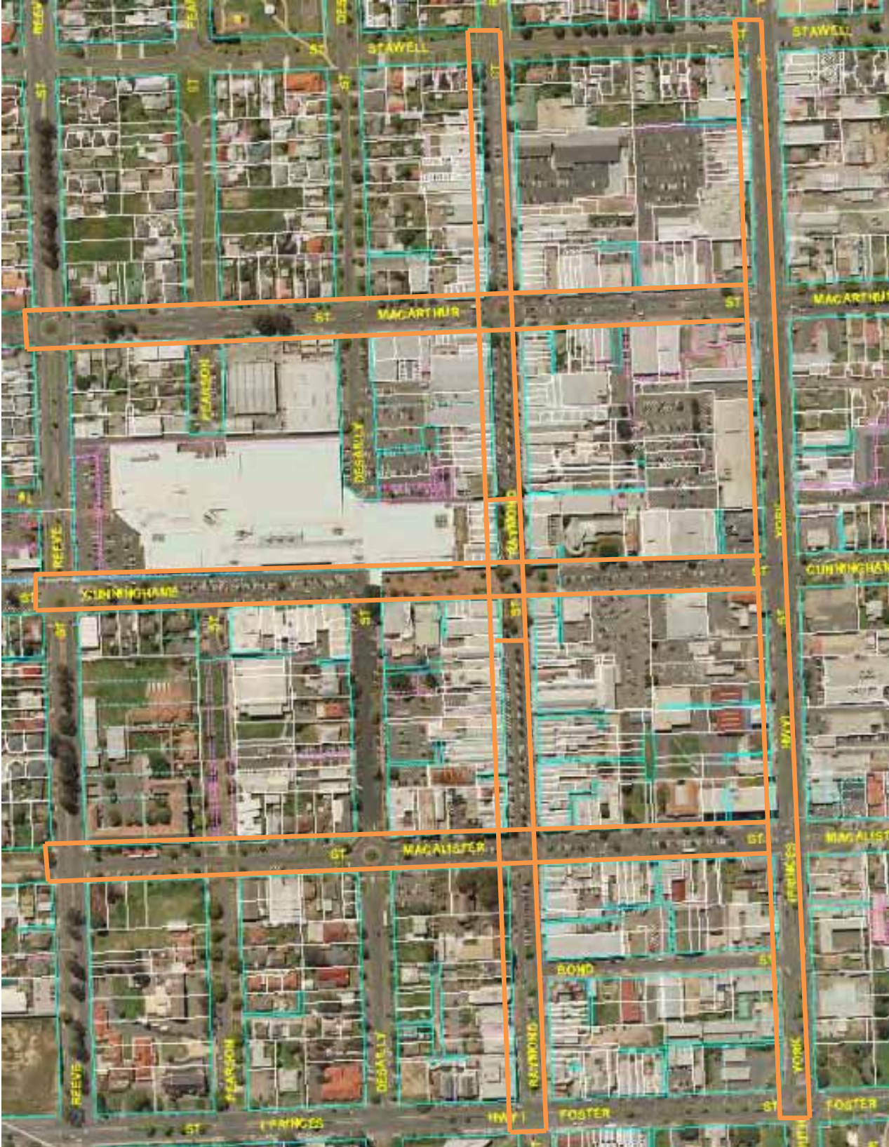
Map 1-6: Sale CBD Streets